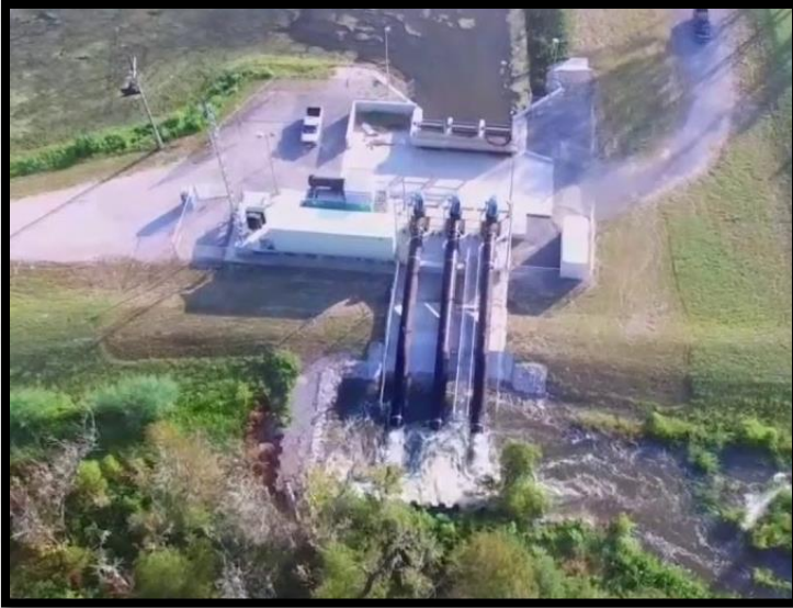
Willowridge Pump Station