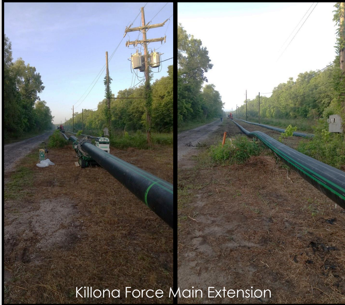
Killona Force Main Extension