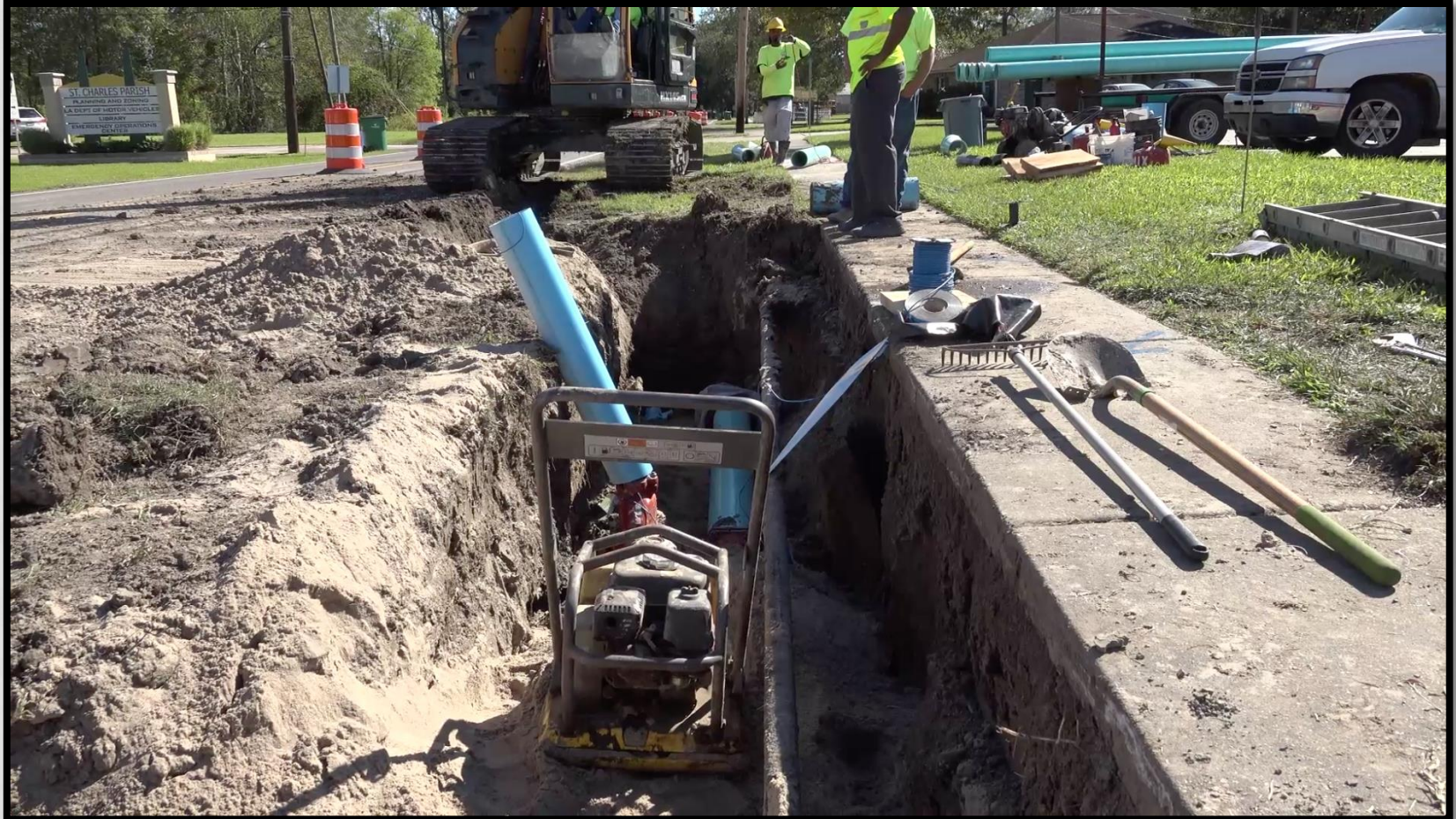
LA 18 Cast Iron Water Main Replacement Phase II