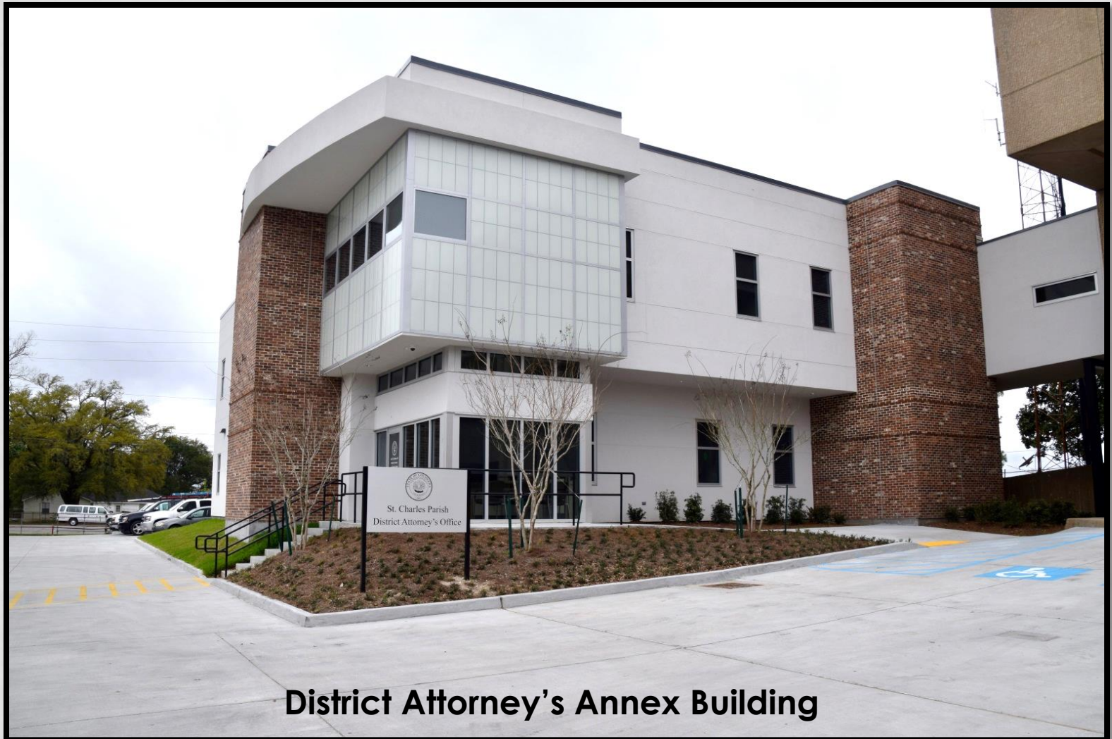
District Attorney's Annex Building