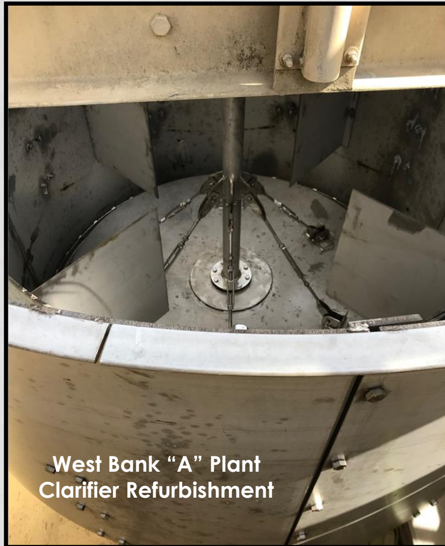
West Bank "A" Plant Clarifier Refurbishment