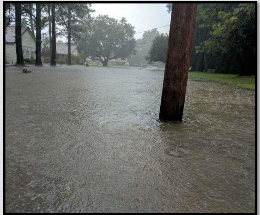
Plantation Road in Hahnville August 29, 2017