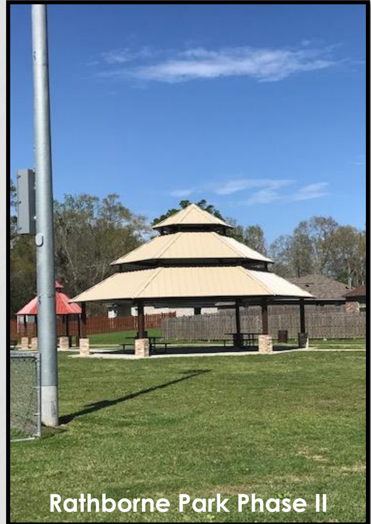
Rathborne Park Phase II