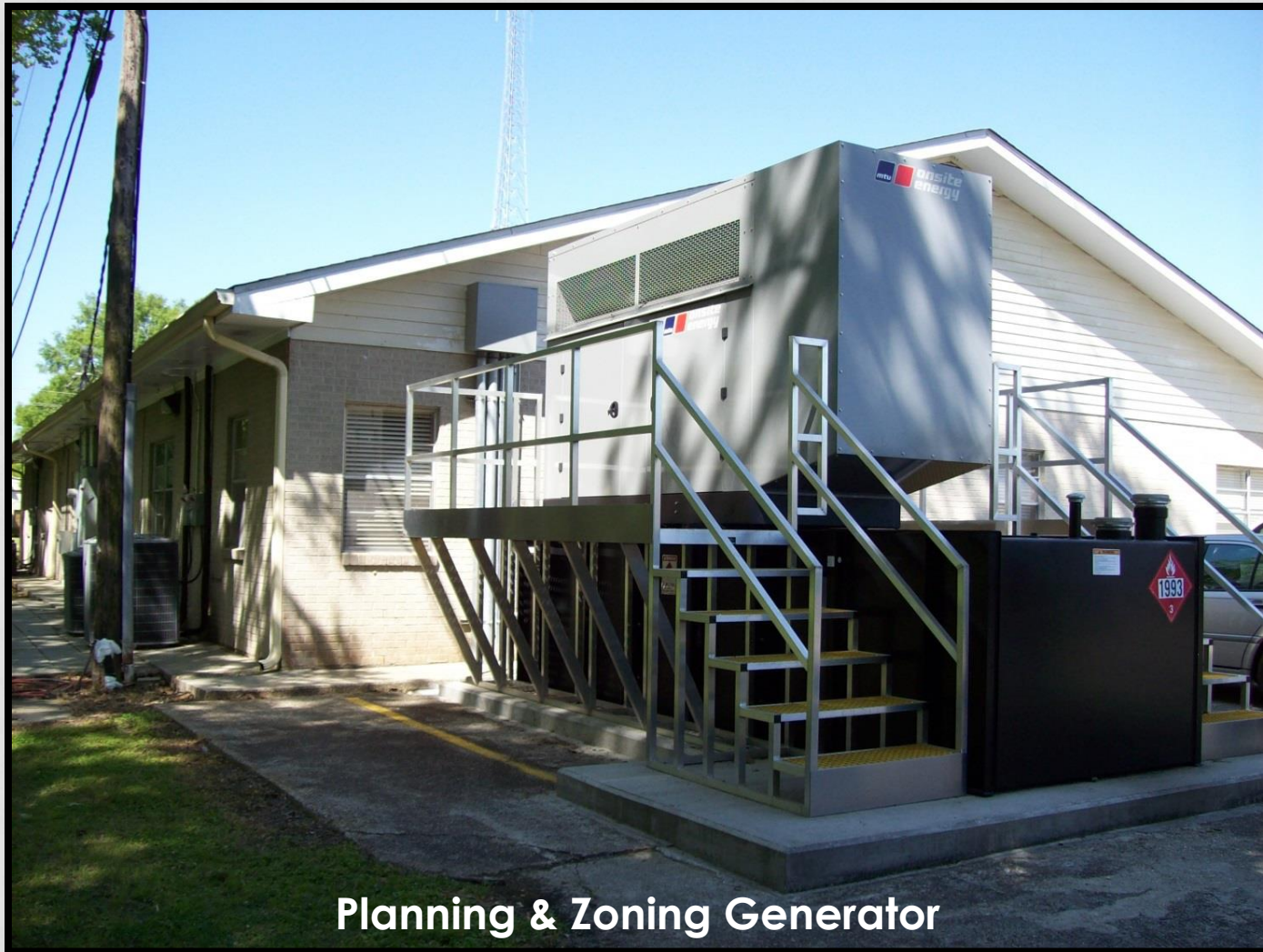
Planning & Zoning Generator