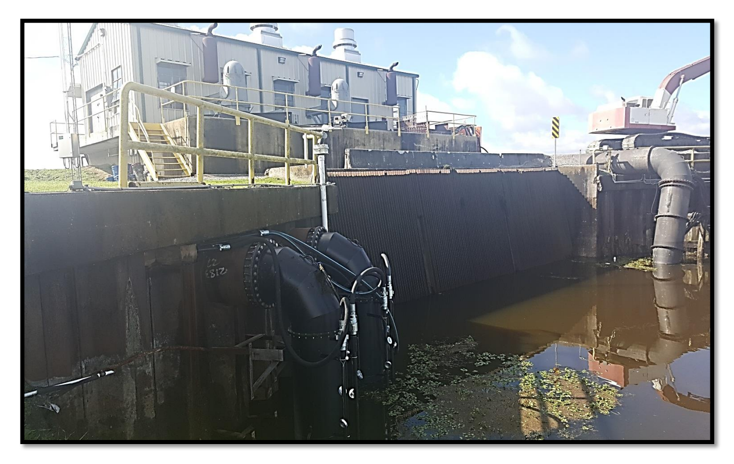
$562K – Sunset Pump Station Capacity Increase