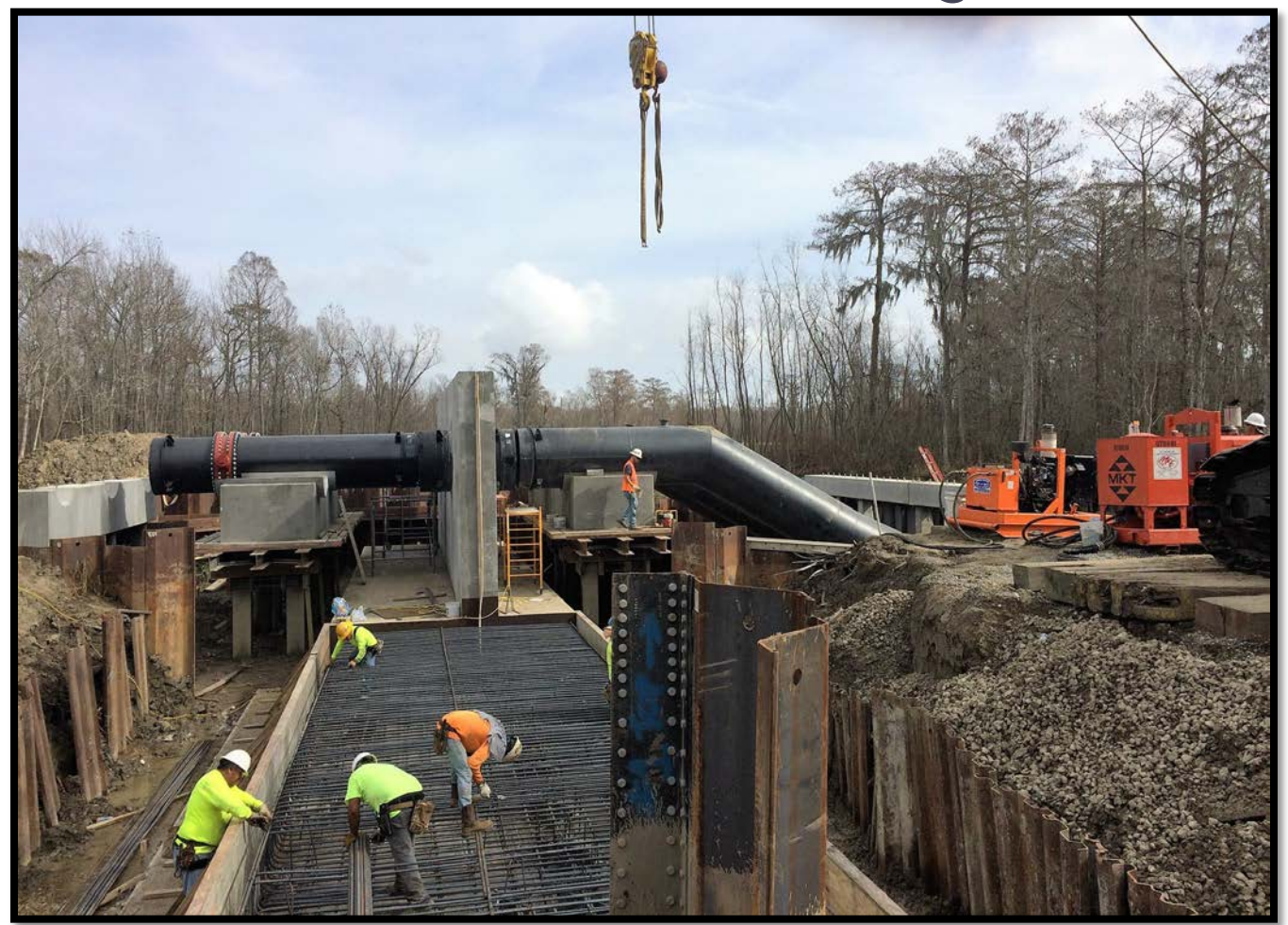
$2.9M – Willowridge Levee Phase III