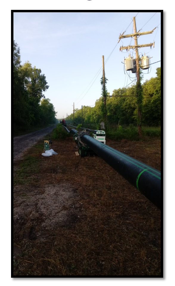
$800K – Killona Force Main Extension