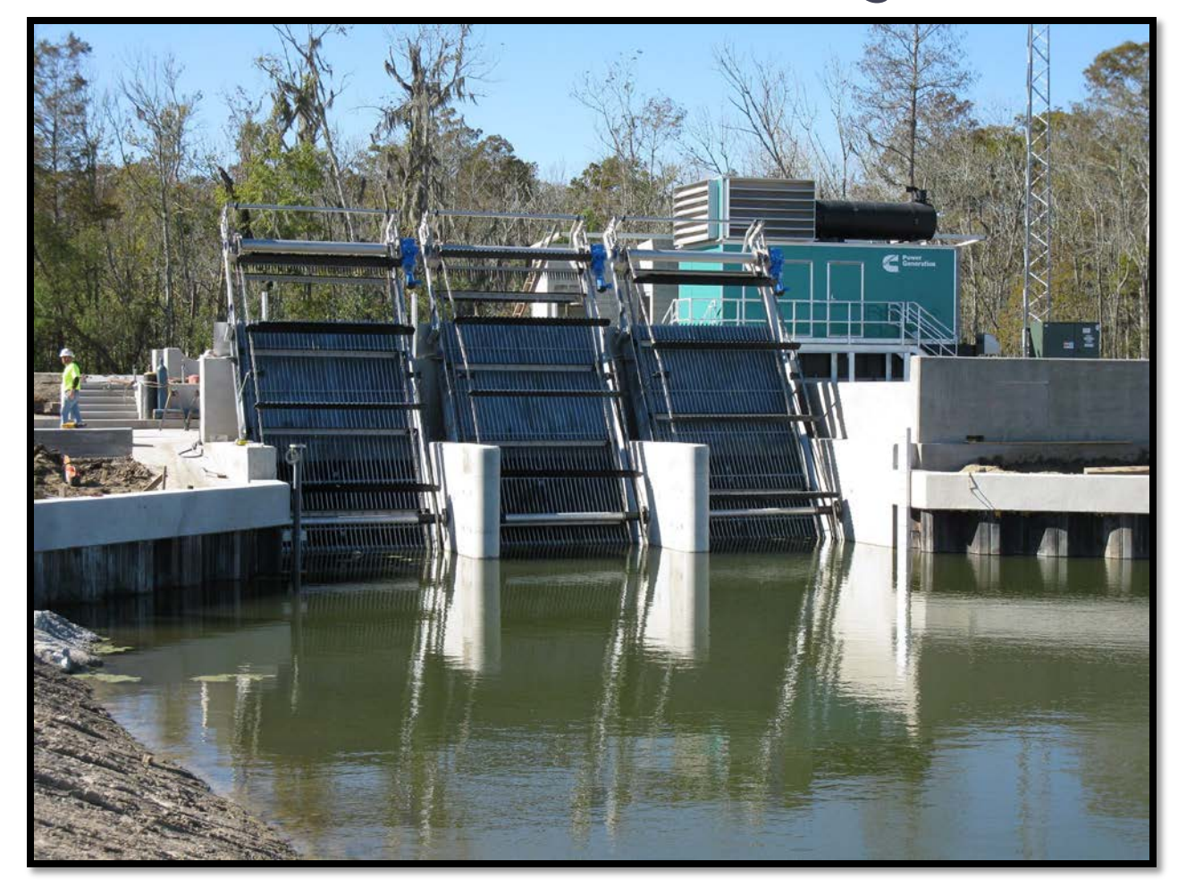
$2.3M – Willowridge Pump Station