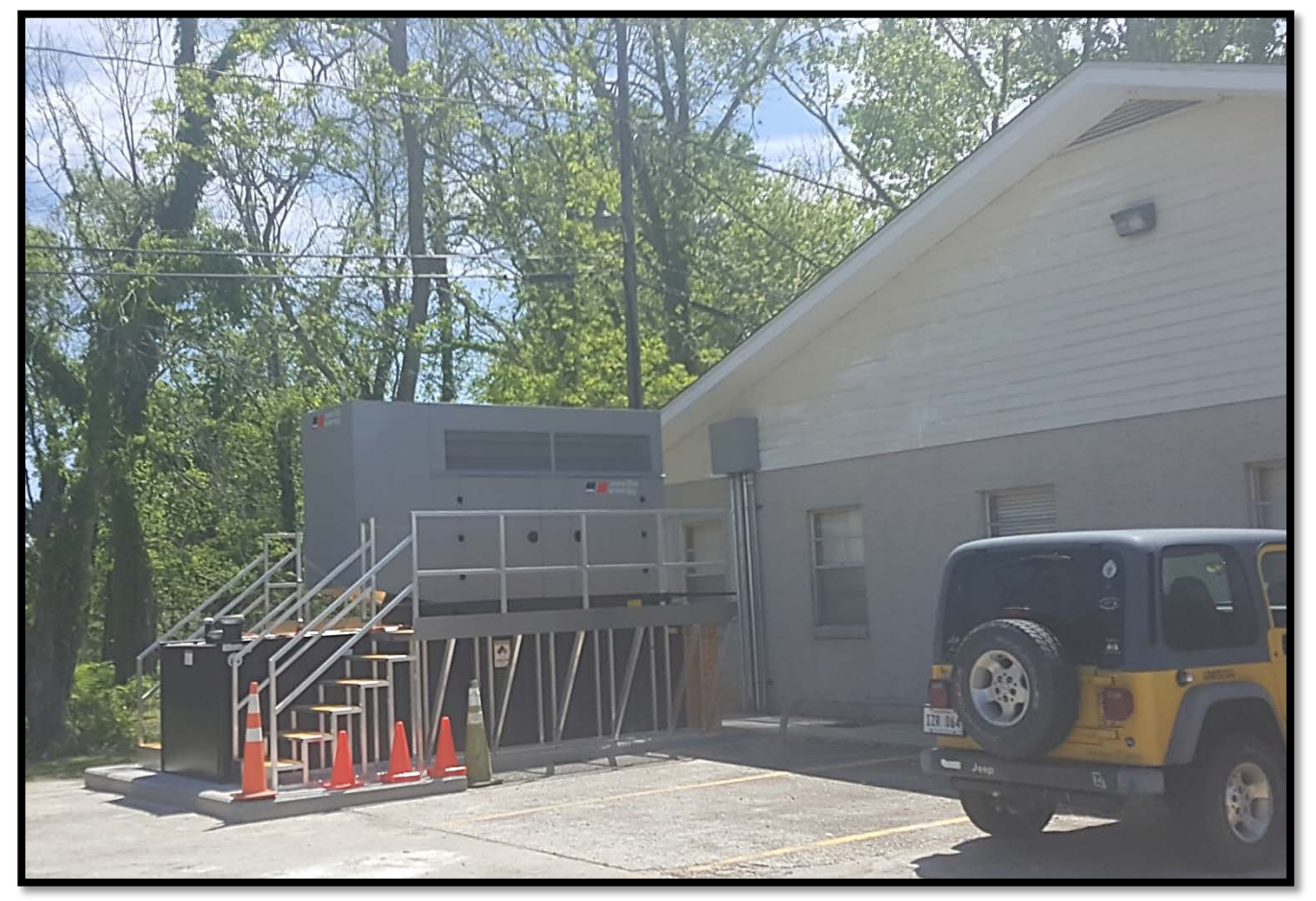
$174K – Planning & Zoning Generator