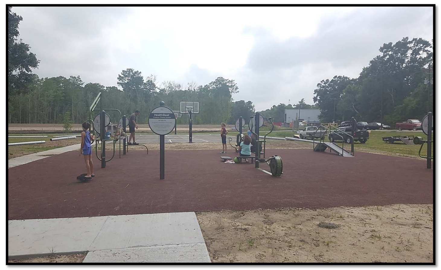
$200K – Rathborne Park Development Phase II