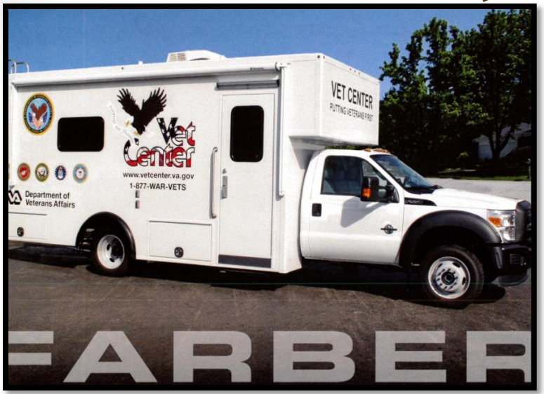
$267K – EOC Mobile Communications Unit