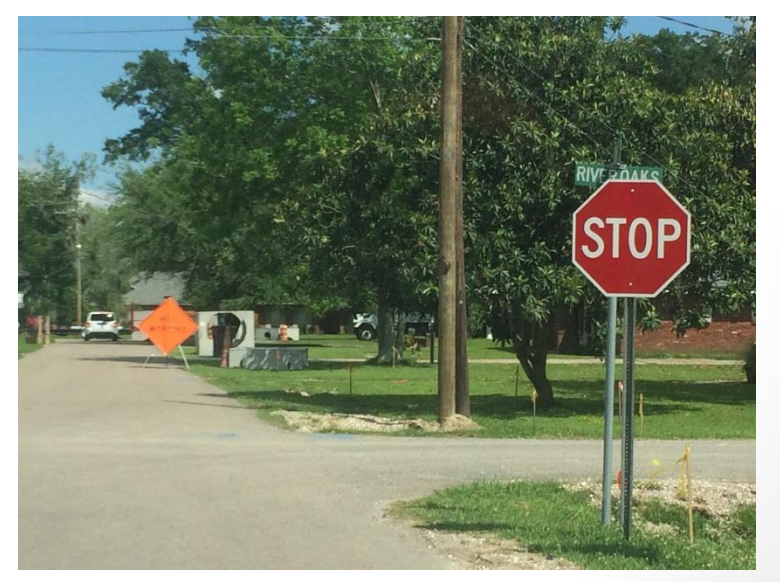
$559K – Mimosa Park Drainage Improvements