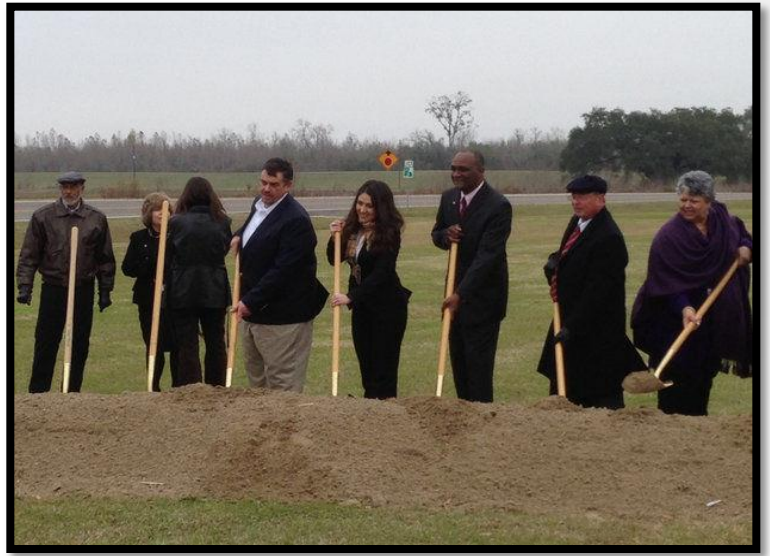
$176K – Killona Community Center