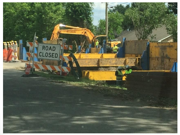
$1.1M – Primrose Canal Crossing Culvert Improvements